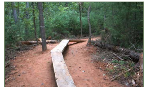
Featured Project: Richmond Hill Skills Trail (Design & Construction) - Asheville, NC

919-960-1559 | INFO@NATURETRAILSN.C CHAPEL HILL NC | BREVARD NC | SALT LAKE CITY UT